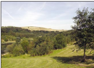
Queen Mothers Meadow, Stinesdale

Planting a new tree, or installing a bench or plaque helps people to come to terms with their loss and creates a special place for friends and family to visit and to remember and reflect. Alternatively, a tree can be planted to celebrate a new life, a wedding, anniversary or other major event. After your tree planting, you will be issued with a lovely certificate.