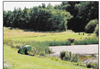
Salmon Fields Meadow

'Life for a Life' is proud to be a NOT FOR PROFIT, NON-DENOMINATIONAL registered Charity, that makes regular quarterly donations to 22 hospices, throughout the United Kingdom, 4 of which are for terminally ill children under the age of 16. Financial support is also extended to The Royal British Legion and S.S.A.F.A.